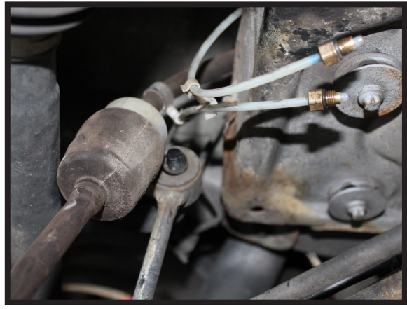
GURE B FIGURE (

4. DISCONNECT THE AIR FILTER FROM CHASSIS. IT WILL BE REUSED DURING INSTALLATION. (FIGURE D)